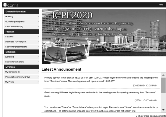
Top page of ICPE2020 virtual conference

The 18th International Conference on Precision Engineering (ICPE2020) was held on 24th to 26th November, 2020 as a virtual conference from Kobe, Japan. Initially, ICPE2020 was planned to hold in Kobe. However, due to the COVID-19 pandemic continues to be a global issue, the conference committee had to decide to cancel the face-to-face conference and transition to the virtual conference. ICPE is the principal international conference organized by the Japan Society for Precision Engineering (JSPE). The first ICPE was held in 1974 in Tokyo and the ICPE is held every two years since 2006.