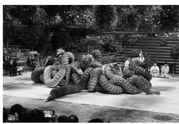
Traditional Japanese dance theater "Iwami Kagura"

On Nov. 15th, a post-conference tour was organized to visit the Shimane Fujitsu Ltd., an advanced factory for laptop computers and tablets based on the Fujitsu's IOT cloud platform, and Izumo Grand Shrine, which is one of the oldest Shinto shrines dedicated to Okuninushi-no-mikoto known as the deity of nation building and good marriage.