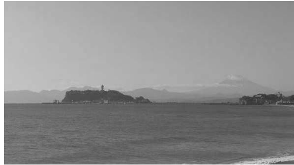
Mt. Fuji and Enoshima from the venue

A total of 201 academic contributions were presented in four parallel oral sessions. The topics cover diverse fields closely related to precision engineering such as precision machining technologies, machine tool, metrology, manufacturing system, additive manufacturing, and so on.