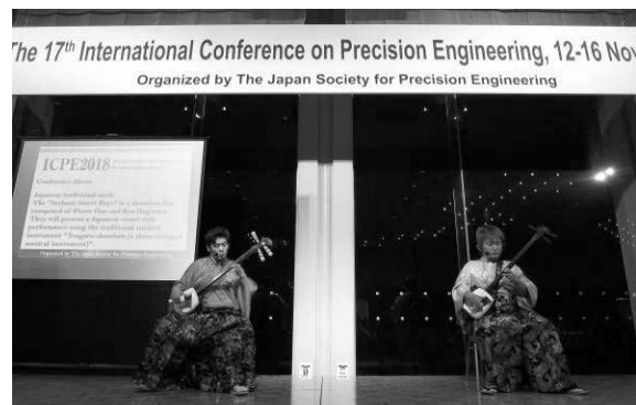
Traditional Japanese music "Tsugaru-shamisen"

At the banquet held on Nov. 14th, attendees enjoyed delicious food and a traditional Japanese music "Tsugaru-shamisen". Best paper awards given to 9 papers and 10 winners of young researcher awards were announced at the banquet.