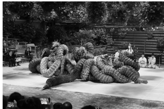
Traditional Japanese dance theater "Iwami Kagura"

On Nov. 15th, a post-conference tour was organized to visit the Shimane Fujitsu Ltd., an advanced factory for laptop computers and tablets based on the Fujitsu's IOT cloud platform, and Izumo Grand Shrine, which is one of the oldest Shinto shrines dedicated to Okuninushi-no-mikoto known as the deity of nation building and good marriage.