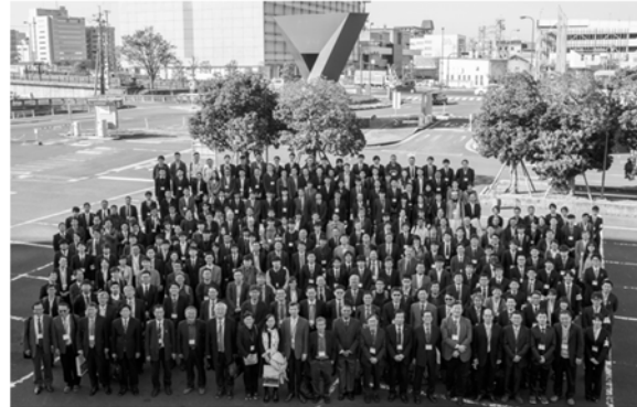
Group photograph in front of the venue

At the banquet held at Matsue Vogel Park on Nov. 14th, attendees enjoyed delicious local food and a traditional Japanese dance theater "Iwami Kagura". Best paper awards given to 13 papers and 14 winners of young researcher awards were announced at the banquet.